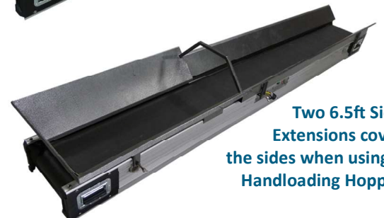
Two 6.5ft Side Extensions cover the sides when using a Handloading Hopper