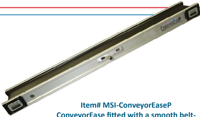
Item# MSI-ConveyorEaseP ConveyorEase fitted with a smooth belt-

ConveyorEase with a smooth belt- $2,499.00