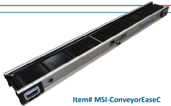
Item# MSI-ConveyorEaseC ConveyorEase fitted with a 1" cleated belt-

ConveyorEase with a 1" cleated belt- $2,677.00